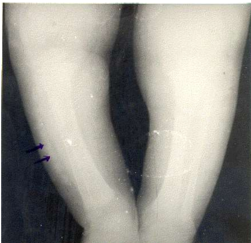
Figure-1. Roentgenogram of the lower extremities showing diffuse subcutaneous calcifications (arrow).

hypercalcemia consisted of intravenous hydration and intravenous Furosemide 1mg/kg 6 hourly, but the serum calcium remained high and started on oral Prednisolone 2mg/kg divided in to two doses. In 72 hours of initiation of prednisolone, serum calcium has normalized (8.2mg/dl) and the drug discontinued gradually after a week. Four weeks after the onset, she started to gain weight and the skin lesion resolved in two months time and she was quite healthy subsequently during her follow up visit for one year.